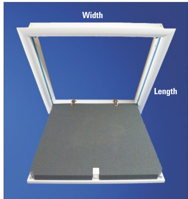
Figure: Access hatch with thermal protection WS3D.

Material: 48 mm polyethylene-thermodeck; Ceiling connection system for the installation gap: double-sided adhesive sealing tape and insulation braid Insulation value U=0.75 \text{ W}/(\text{m}^2\text{K}) Air-tightness value connection system a=0.02 \text{ m}^3/\text{hm}(\text{daPa}^{2/3}) incl. sealing system for air-tight installation