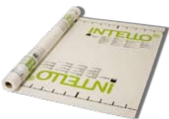
INTELLO Intelligent vapour check and airtightness membrane with humidity-variable diffusion resistance for active moisture management.

The INTELLO vapour check and airtightness membrane is laid on the interior, beneath the insulation. Bonding with adhesive tapes should be on the smooth printed side. Staples should be 10 mm wide and 8 mm long and set at a max. distance of 10-15 cm.