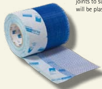
CONTEGA PV Plaster sealing tape for secure, long-lasting joints to surfaces that will be plastered.

For masonry which have yet to be plastered, the plaster sealing tape CONTEGA PV gives a secure, airtight transition. The tape is first attached to the smooth side of the vapour check using its self-adhesive strips.