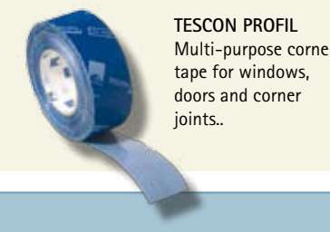
TESCON PROFIL Multi-purpose corner tape for windows, doors and corner joints..

In the second step, simply remove the rest of the release paper and finish sealing.