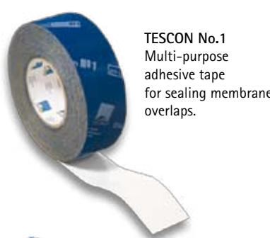
TESCON No.1 Multi-purpose adhesive tape for sealing membrane overlaps.

Just as important as the sealing of overlaps are joints to adjacent structural components. TESCON No.1 is used for joints to smooth, non-mineral structural components (such as this jamb wall made of OSB panels). Gable walls are treated similarly.