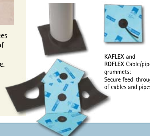
KAFLEX and ROFLEX Cable/pipe grummetts: Secure feed-through of cables and pipes

If pipes or cables go through the airtightness layer, they too must be securely sealed. The most suitable means of doing this is with airtightness grummetts made from EPDM. This flexible material allows a tight fit, and KAFLEX is available in all common diameters. Cable grummetts have a self-adhesive. Remove the release paper, push over the cable and stick on. ROFLEX Pipe grummetts are affixed using TESCON No.1. Press firmly to secure the adhesive tape.