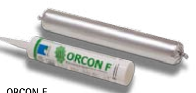
ORCON F Multi-purpose joint adhesive in cartridge or tubular film. For joints to adjacent mineral or rough structural components

The joint adhesive ORCON F is applied to adjacent mineral structural components or rough wooden components (e.g. plastered walls or rough timber) with a continuous bead of approx. 5 mm thick ORCON F. With rough surfaces, increase the bead size as required. Glue the vapour check, with an expansion joint, to the adhesive bead. To allow for movement, do not press the glue completely flat. Pressure laths are usually not required on stable surfaces.